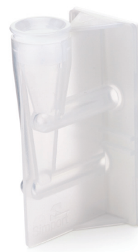
Double Cytology Funnel