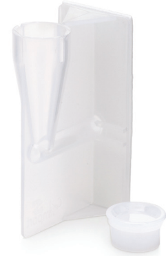
Single Cytology Funnel