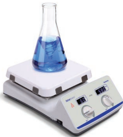
Isotemp stirring hotplate