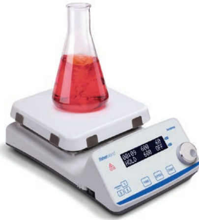
Isotemp Advanced stirring hotplate