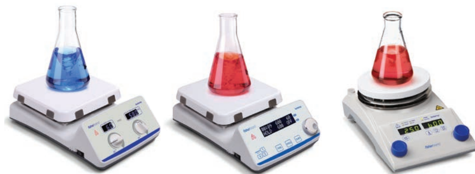
(L-R) Isotemp, Isotemp Advanced, Isotemp RT Advanced series

With a wide variety of features and options, the Isotemp Series, Isotemp Advanced Series, and Isotemp RT series of hotplates, stirrers, and stirring hotplates support all your applications – from basic stirring needs to the most precise high-temperature heating and control. Improve your process. Customize your workflow.