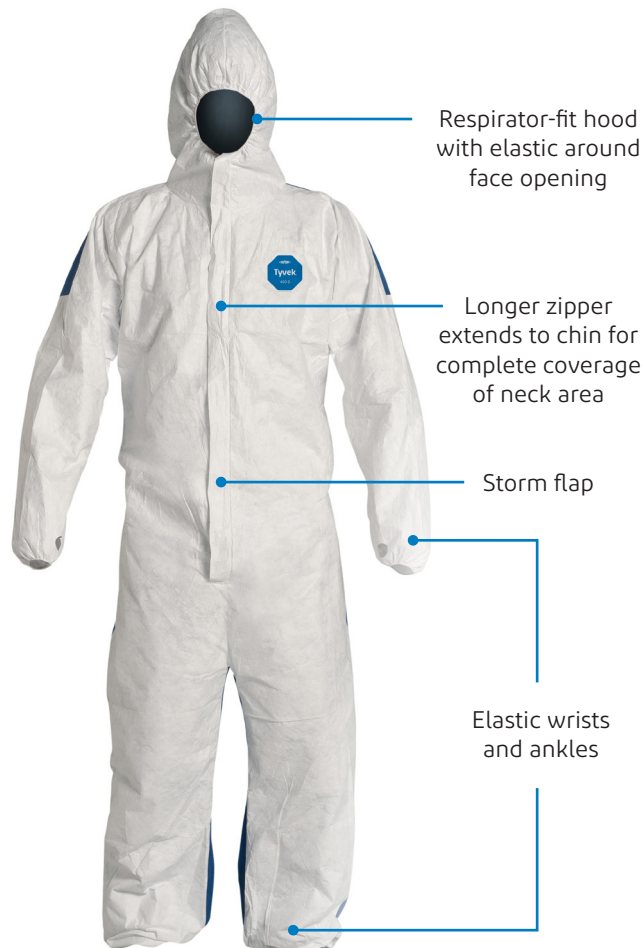
TD127S (with hood)

ProShield® 10 fabric back helps increase breathability and reduce heat stress.